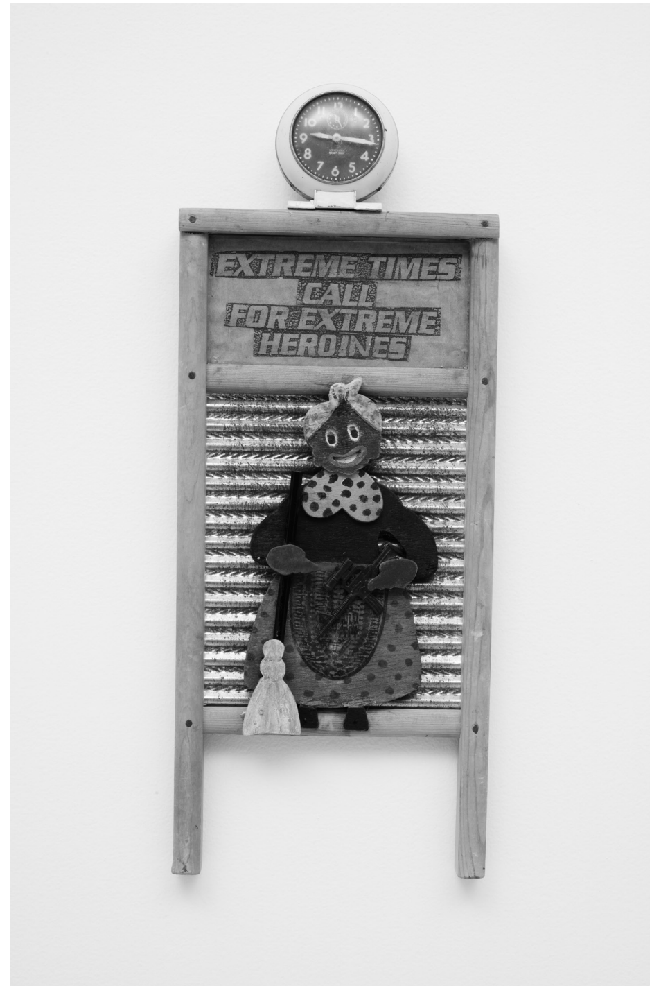
fig. 1 Betye Saar, Extreme Times Call for Extreme Heroines , 2017. Mixed media assemblage, 21.5 x 8.62 x 1.5 in (54.6 x 21.9 x 3.8 cm).

Betye Saar, 'Influences: Betye Saar', 27 Sept 2016, Frieze.com . Accessed online through: https://frieze.com/article/influences-betye-saar on 10 June 2017.